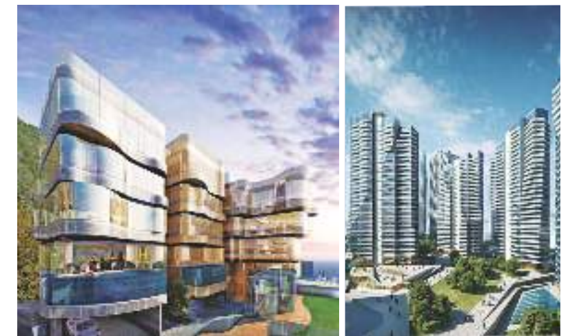
Projects designed by Aedas, Singapore